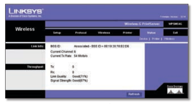
Status > Wireless

The Wireless screen displays status information of the PrintServer's wireless connection. No values can be changed on this screen. Click the Refresh button to update the information on this screen.